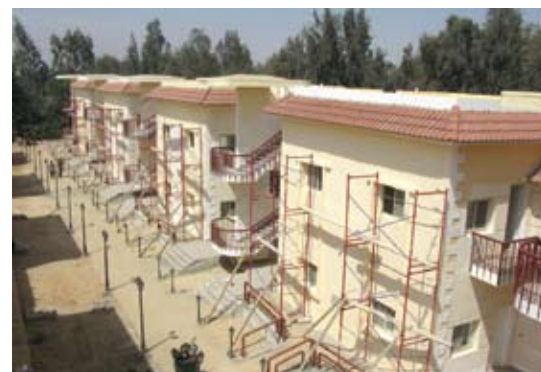
Health & Hope Oasis