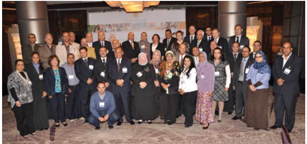
Representatives of the Winning NGOs in the Job Creation competition 2010

Most of the initiatives supported by the foundation are funded through competitive grants. In large part, these grants are innovative, responsive to community and labor market needs, and sustainable. Academic scholarships and literary awards are also offered on a competitive basis.