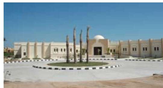
Gouna Technical Nursing Institute