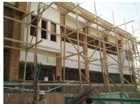
Viral Hepatitis center in Suez